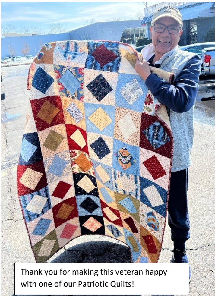
Thank you for making this veteran happy with one of our Patriotic Quilts!

During the April, 2024, Empire Quilt Festival (EQF) Quilt North will have a Boutique Table. With your help and creativity, we will offer for sale a plethora of handcrafted items. This fundraiser for Quilt North has always been very successful and let us all do our part to make it better than ever. It is never too early to start our projects. Please contact me at: sassews2day@gmail.com with your ideas and commitment to help.