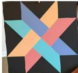
Pattern 4: Beginner