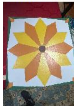
Pattern 9: Intermediate