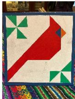
Pattern 2: Beginner