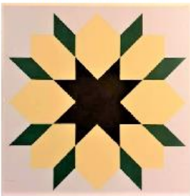
Pattern 1: Intermediate