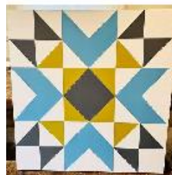
Pattern 7: Advanced