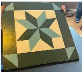
Pattern 3: Beginner