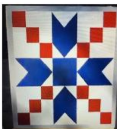
Pattern 6: Advanced