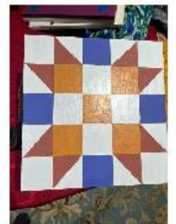
Pattern 5: Beginner