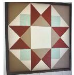
Pattern 3: Beginner